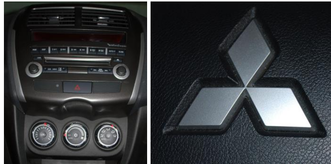
Fig9. ASX Console and knobs